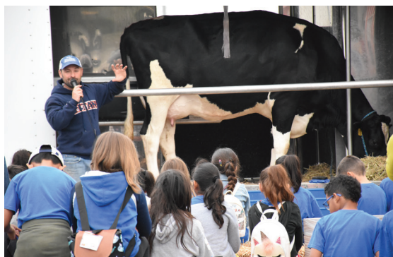
Dairy Council of CA/Mobile Dairy Classroom demonstration. Dairy Council celebrates their 100 year anniversary this year.

Deadline to apply: September 1, 2019. Access the application at https://form.jotform.com/71245903554153 .