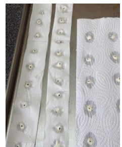
Using flour and water paste

Now for planting the California Poppy Seed. They rely on fall rains and cooler temperatures to germinate and grow. So, wait until sometime late October, early November. Dig down in the soil about 1/8-1/4 inch where you wish to see the poppies grow and flower. It does not need to be an irrigated area if you are able to apply additional water in the event, we do not receive sufficient rainfall. Gently water so as not to disturb the area, then come out with about a one-half gallon of water the next week if we have not had rain. They need to be watered about 4-5 times in the fall if no rainfall. Then once they are growing, you do not need additional water past December or early January.